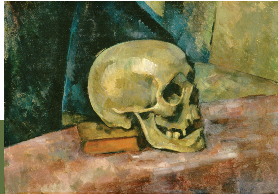
Paul Cézanne, Still Life With Skull , c. 1900