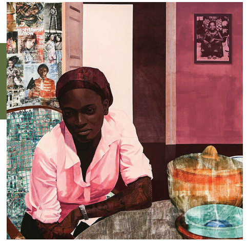
Njideka Akunyili Crosby, Mother and Child , 2016