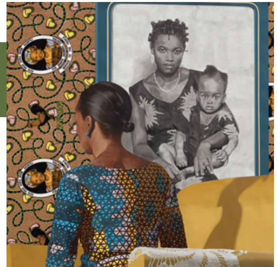
Njideka Akunyili Crosby, Mother and Child , 2016